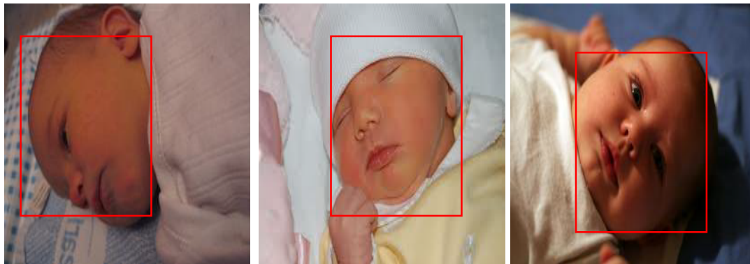
Figure3. Face Detection results

Because the Haar Classifier is part of the OpenCV library, the source code should be well optimized. OpenCV is a popular open source image library that was originally created by Intel. The data structures and algorithms in OpenCV have been carefully tuned to run efficiently on modern hardware. It is evident from the code of the Haar Classifier that hand optimization was used to improve the performance of that algorithm